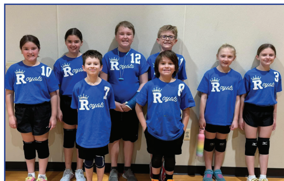
Congratulations 3/4 Volleyball. They ended the season with a win!