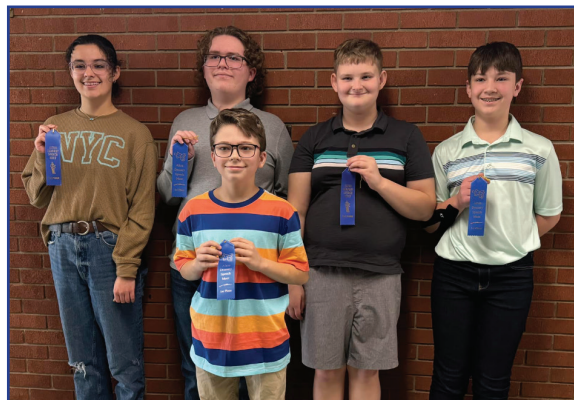
St. Elizabeth represented themselves well at the speech meet last Saturday morning with all first place finishes. Great job everyone.