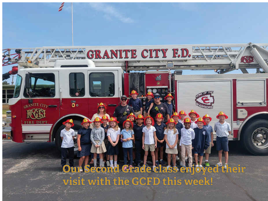
Our Second Grade class enjoyed their visit with the GCFD this week!

Remember: Catholic education starts at Sunday Mass! School families, don't forget to continue submitting your Mass cards at Sunday Mass.